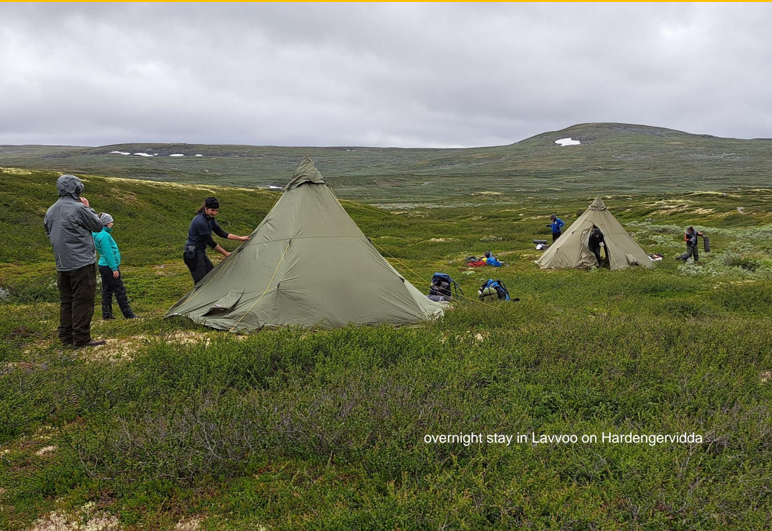
overnight stay in Lavvoo on Hardangervidda